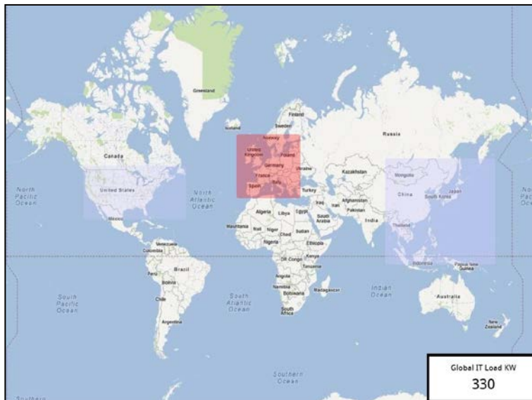
Fig 2. HTML5 Dashboard in Options NOC showing Global View with UK Fault

In addition to the rack PDUs, the sites contained a number of UPS, chillers and AHUs (Air Handling Units) which needed to be monitored. Furthermore, Options wanted to monitor its sites’ PUE values. All the devices supported SNMP.