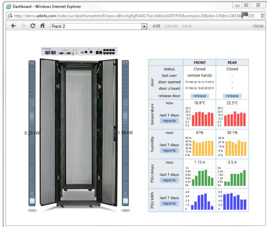
Fig 3. HTML5 Dashboard from Insite Demonstration site showing example Rack

“We have improved the monitoring of our power estate, ... reduced PUE and seen a return on our investment within 6 months”